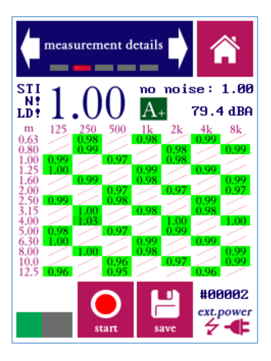
Figure 5. Full STI implementation on the Bedrock SMxx, while measuring. The analyser is synchronized and in the second stage of the signal.

The novel Full STI was first implemented in Matlab. This Matlab implementation of Full STI was tested with the standard series of sine-based validation test vector, and passed. Next, a real-time implementation of the Full STI was developed for the Bedrock SMxx series of acoustic analyzers.